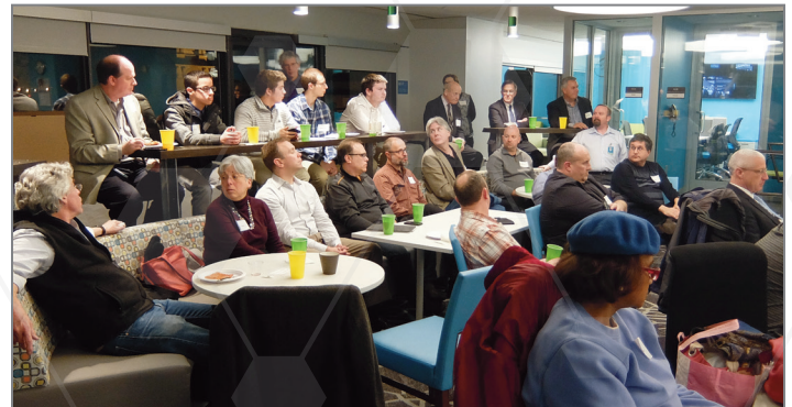
Attendees from around Western Massachusetts gather for the January 2016 edition of 'Tap into TechSpring,' a monthly event which brings together healthcare and technology innovators to discuss specific issues, highlight ongoing projects, and identify potential partnerships in the region.

In addition to being a home office for startups, TechSpring also partners with mid to large technology companies providing "access to a real, live health system using a proven process and platform to test and validate digital health solutions." For example, TechSpring is partnering with Dell on an innovative partnership, launched in summer 2015, which revolves around predictive analytics and telehealth . They're also working with Cambridge, Mass.-based Twine Health on an innovation-focused project. Twine, which recently raised $6.75 million in new venture capital funding , worked with TechSpring to test its